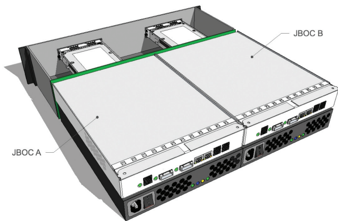
Figure 3 HA Cloud JBOC Enclosure.

An enhanced version of E3S would be implemented as an E3S JBOC™ (Just-a-Bunch-of-Clouds). The E3S JBOC would have dedicated compute horsepower to provide a more robust feature set, including dedicated cache, greater processing power and the ability to disperse data across multiple cloud SSPs, thereby greatly improving both availability and security of the data. Using IDA, along with additional data integrity options, E3S JBOC can guarantee data availability in cases where a cloud SSP is out of service or has experienced data corruption or loss. These features will be discussed in greater detail in a future paper.