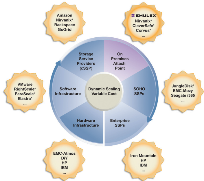
Figure 1 Cloud storage ecosystem.

Solutions targeting cloud infrastructure seem to be appearing on every technology company’s roadmap, even to the point of old technology being repositioned to take advantage of the buzz created around cloud. However, despite offerings from companies as disparate as, say, VMware compared to Iron Mountain, they all have one thing in common: they are focused on delivering dynamic scaling and pay-as-you-go acquisition.